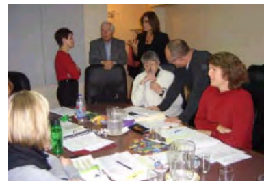
Networking after a recent marketing and fundraising presentation to the Board of Directors.

We are still in need of a Director on our Ontario Board. This is an excellent entry level way to learn about the Block Parent Program from a provincial perspective. There are no specific duties associated with this position - however, if a project comes along for which you feel you would be well suited, you can take it on alone, or as the head of a sub-committee of your choosing, if the task is too large for one person.